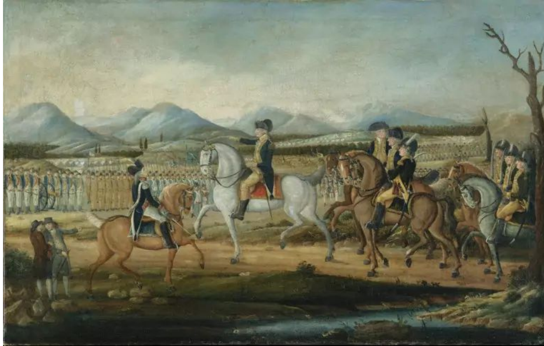
Washington Reviewing the Western Army at Fort Cumberland, Maryland